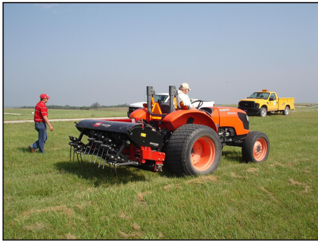
Figure 1. The Toro Deep Tine soil compactor and aerator. Note the long tines.