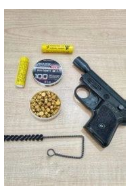
Six shot launcher