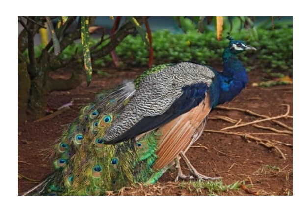
Indian Peafowl dani