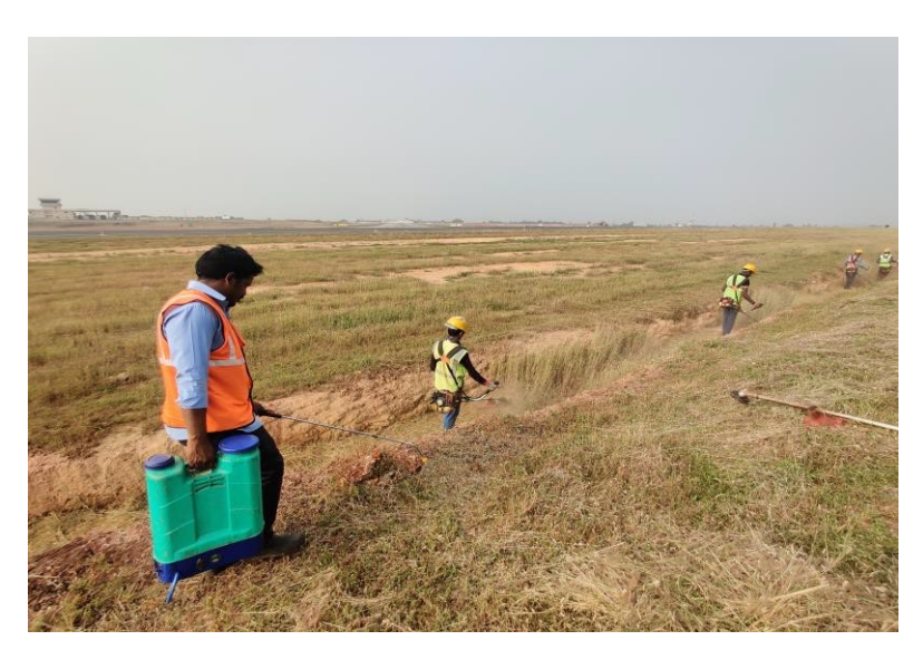
Spraying of eco-friendly insecticide