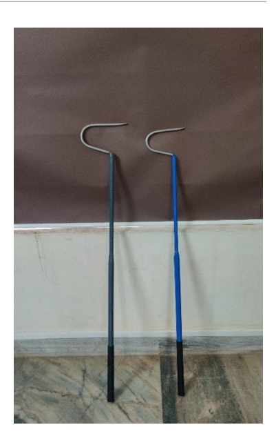
Snake Rescue Hooks