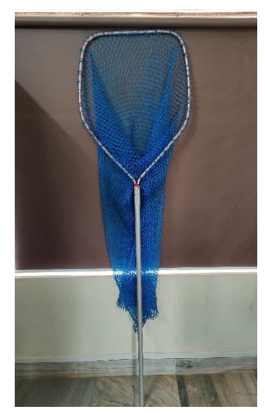
Wildlife Catching Net