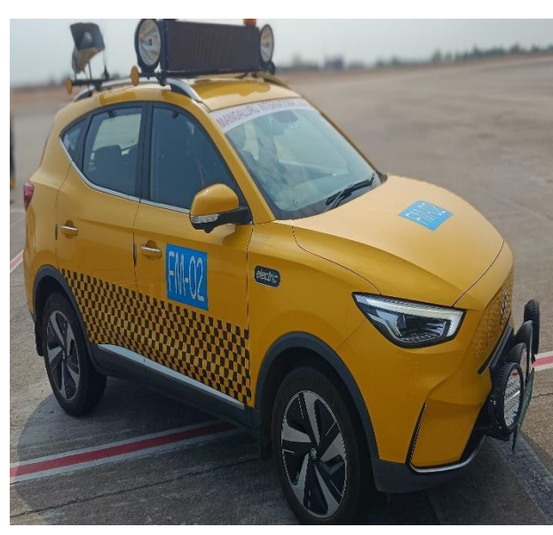
Acoustic devices installed on the follow me vehicles