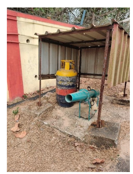
LPG operated Zon Gun