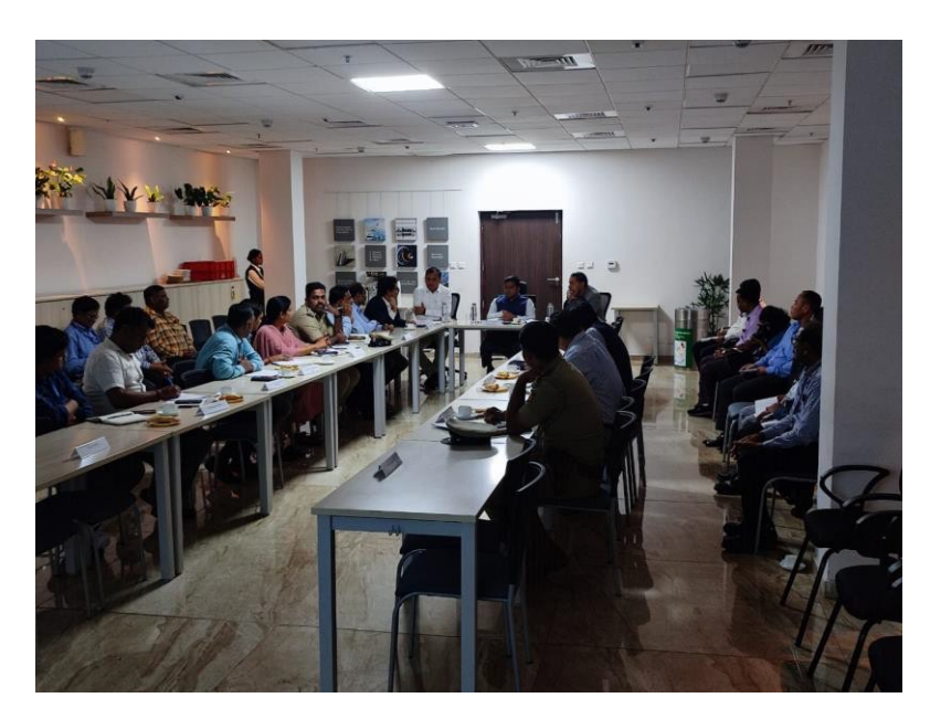
AEMC meeting with the District Commissioner (DC)