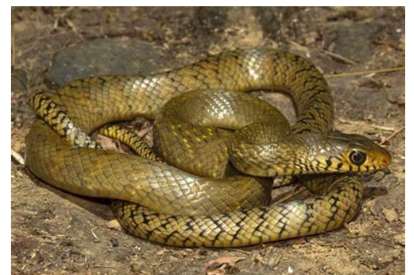
Indian Rat Snake