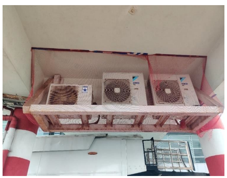
Discouraging roosting spots with bird proof nets.