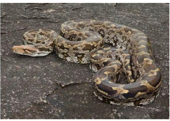
Indian Rock Python