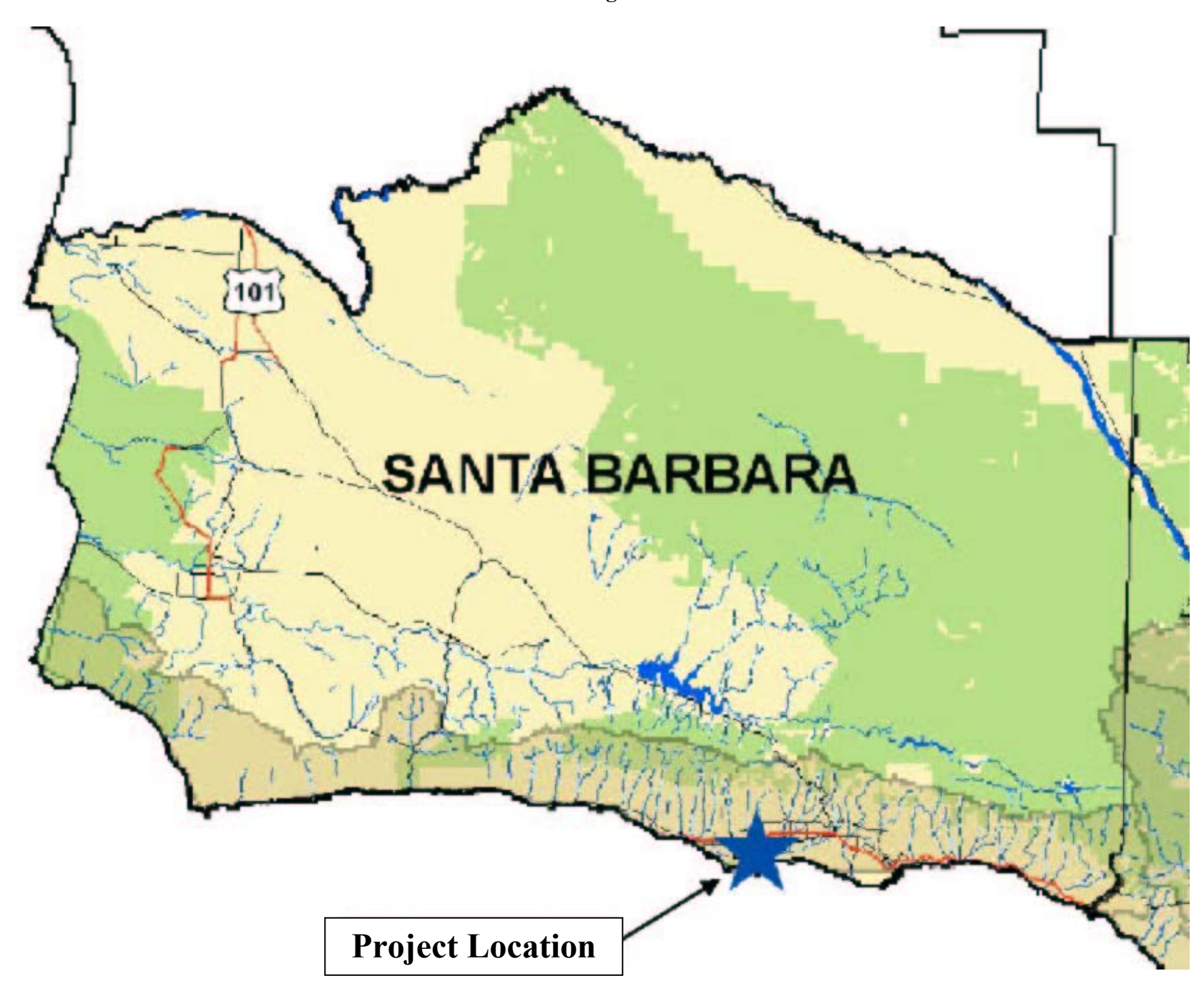
EXHIBIT 1A: Regional Location