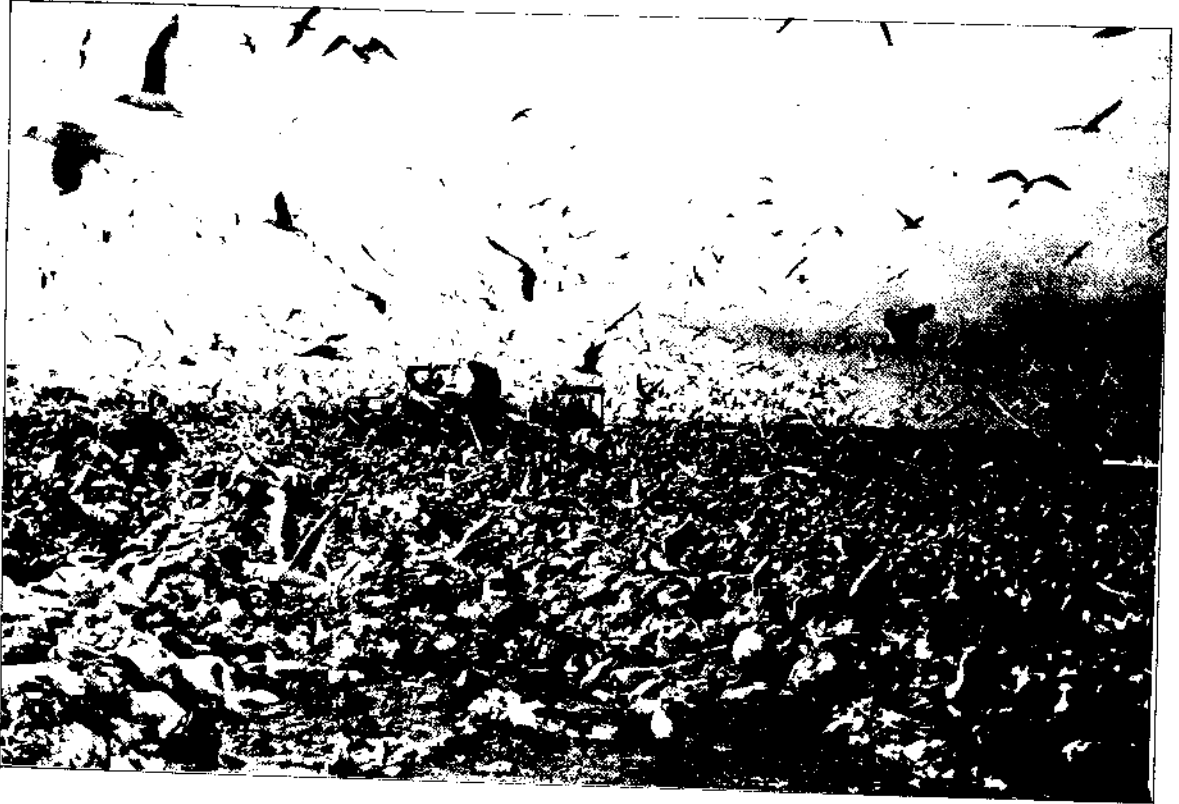
Black-headed Gulls ( Larus ridibundus ) at the Hiria Garbage Dump