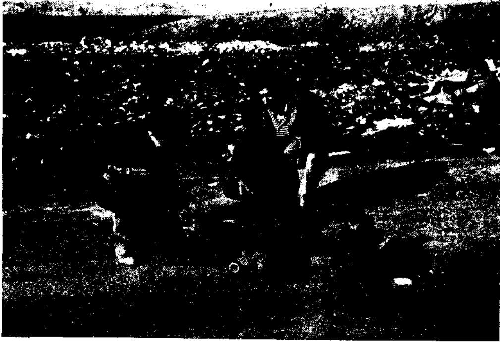
Radio-Controlled Model Aircraft at the Hiria Garbage Dump